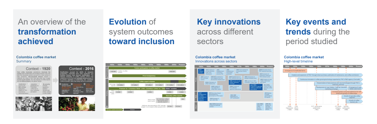
FIGURE 4: ELEMENTS OF AN MSI CASE STUDY

As a tool, these case studies also illustrate the theory behind MSI with tangible examples from specific market systems. The report Shaping Inclusive Markets shares a number of such case studies documented by FSG. Drawing on the principles of MSI, individual practitioners could also develop additional case studies to display other successful transformations toward greater inclusion.