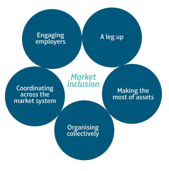
Figure 1: Entry points to overcome economic exclusion

Research seeking to understand the relationship between economic empowerment and overcoming structural barriers has produced mixed results. Access to paid work supports empowerment, particularly where work is regular, visible and delivers social benefits (Kabeer et al. 2011). Some also find that women's participation in the labour market improves their decision-making power in the household (Muller & Chan 2015), although others find no such link (Hafiza, Kamruzzaman & Begum 2015). On the other hand, enterprise development may have negative consequences, such as increasing women's workload without increasing their effective empowerment (Torri, 2014).