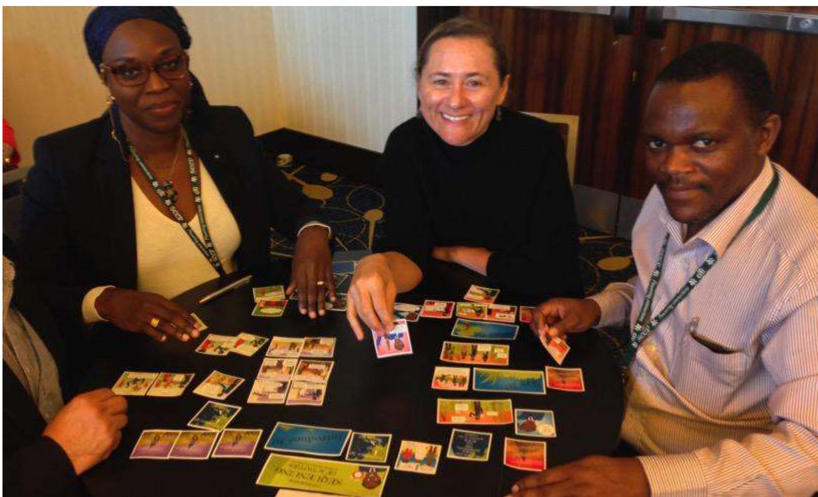
PHOTO: DEVELOPMENT PROFESSIONALS EXPLORING HOW TO USE THE CARTOON STORIES AS LEARNING TOOLS

Cartoons describe both stand-alone illustrations—captioned or non-captioned—and short comic strip formats.