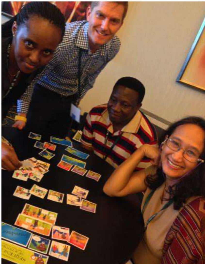
PHOTO: LEARNERS REORGANIZE CARTOON COMPONENTS IN A FACILITATORS' TRAINING WORKSHOP OF GLOBAL PRACTITIONERS IN