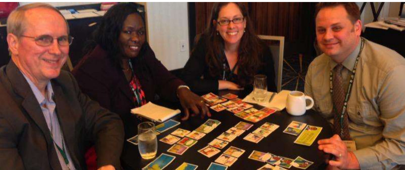
PHOTO: DEVELOPMENT PROFESSIONALS DISCUSS OPTIONS FOR SEQUENCING MARKET SYSTEMS DEVELOPMENT ACTIVITIES