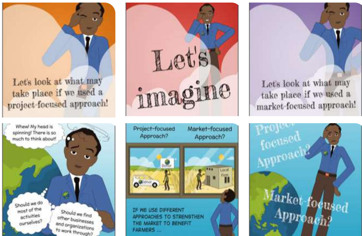
CARTOON EXTRACT: EACH CARTOON CONSIDERS A MORE PROJECT-FOCUSED AND A MORE MARKET-FOCUSED APPROACH, RECOGNIZING THAT MOST PROJECTS FALL SOMEWHERE IN BETWEEN

LEO has designed a practical, fun and experiential learning series of comic-based storybooks. Each depicts and compares different approaches and tactics. The scenarios are based on real-life examples that represent a market development problem and compare different ways of solving it—a market facilitation approach, and a typical, or project-driven, approach. The cartoon learning series allows development practitioners to explore different strategies for improving input supply to smallholder farmers and to strengthen opportunities for smallholder farmers to supply produce to buyers.