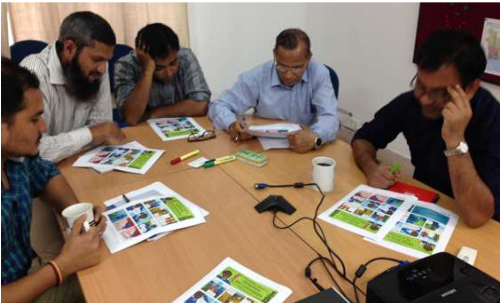
PHOTO: PROJECT STAFF WORKING THROUGH THE CARTOON STORIES IN BANGLADESH