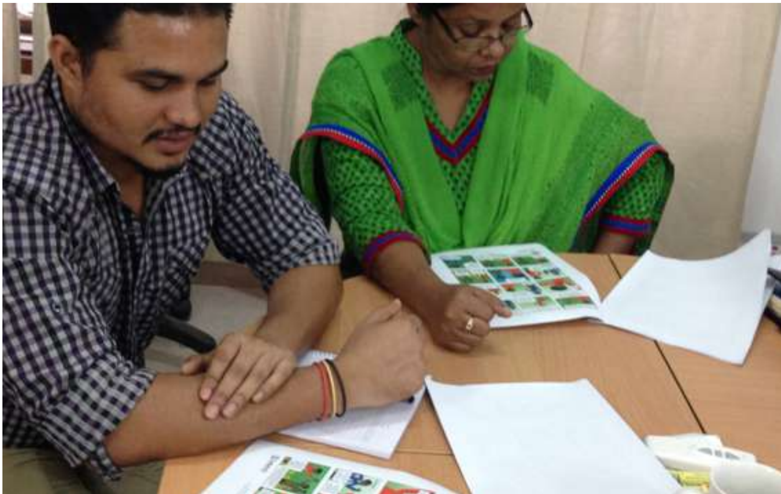
PHOTO: PROJECT STAFF TAKE TURNS TO READ DIFFERENT MARKET ACTOR ROLES AS THEY ROLE-PLAY THE CARTOON STORIES IN BANGLADESH