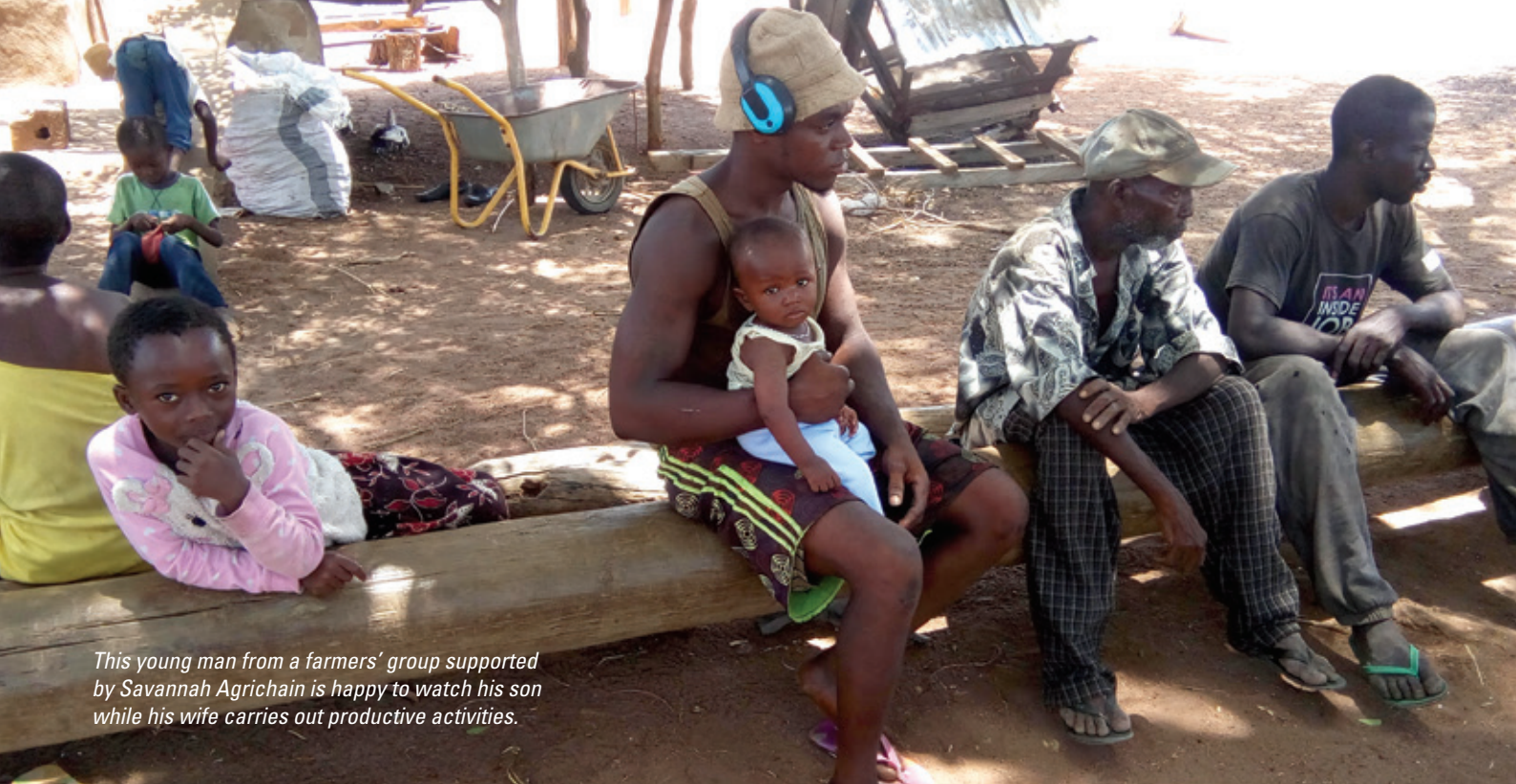
This young man from a farmers' group supported by Savannah Agrichain is happy to watch his son while his wife carries out productive activities.