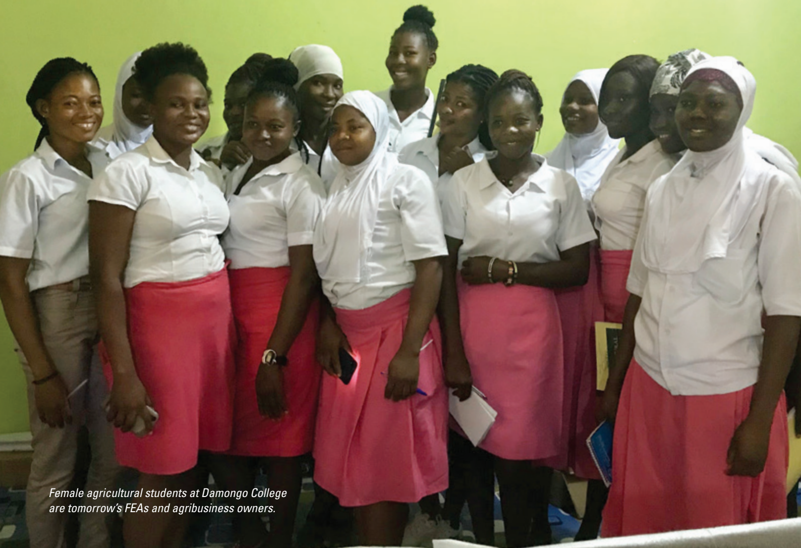
Female agricultural students at Damongo College are tomorrow's FEAs and agribusiness owners.

to three years. He gets a competent FEA for a few years, and the FEA goes back to school with practical knowledge, so it is a win-win.