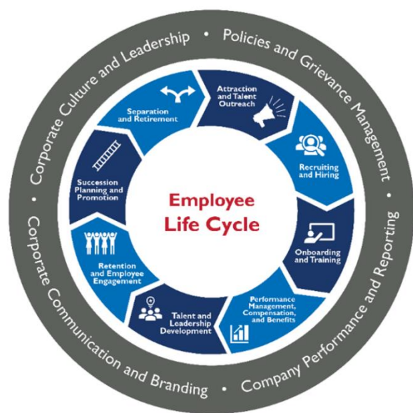
FIGURE I: Employee Life Cycle

The U.S. Agency for International Development (USAID) is committed to both promoting gender equality and women’s empowerment and strengthening all workplaces, especially in male-dominated industries where significant equality gaps are observed, in order to fuel economic growth and social development. Through its Engendering Utilities program, USAID identified the employee life cycle as a key entry point to effecting long-lasting and impactful change within partner electricity and water utilities and identified applicability to other industries. From attraction and talent outreach to separation and retirement, there are numerous opportunities to promote gender equality within any workplace.