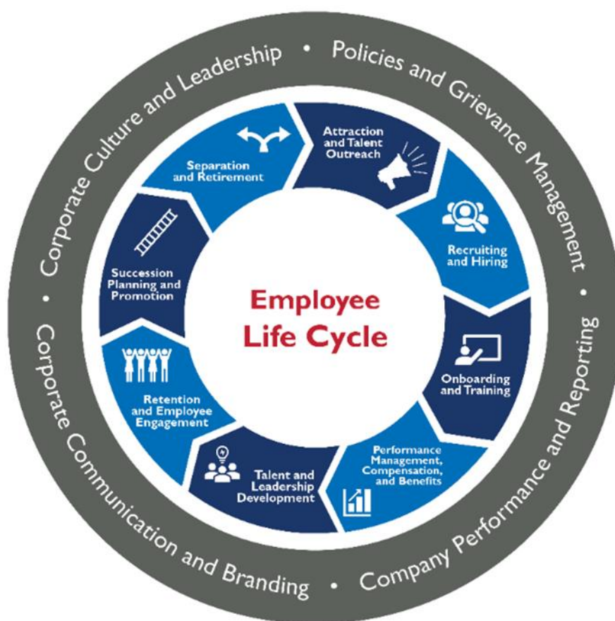
FIGURE 4. Employee Life Cycle

The second layer focuses on Organizational Enablers , which include entry points for gender equality that serve as prerequisites to support interventions within the Employee Life Cycle. These identified organizational enablers are critical, as they may either be success factors or strong hindering factors, and therefore need close attention. These enablers include Company Policies and Grievance Management, Corporate Culture and Leadership Models, Company Performance and Reporting, as well as Corporate Communication and Branding.