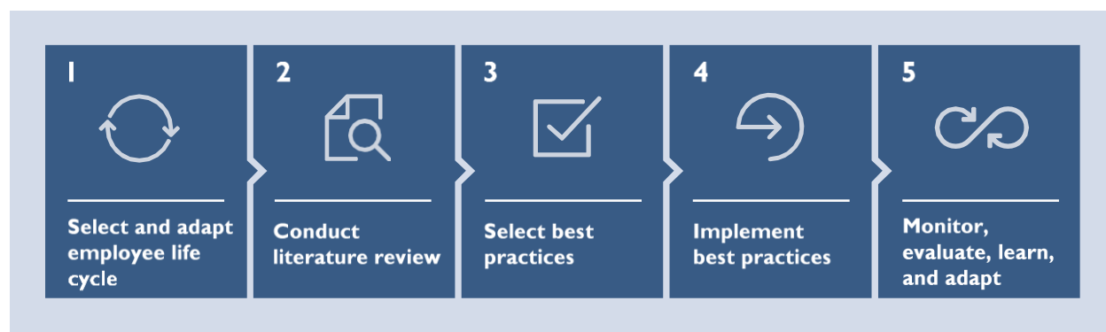
FIGURE 3. Methodology for the Development of the Best Practices Framework

The methodology to develop this framework (as depicted in Figure 3 below) included the selection and adaptation of the Engendering Utilities Employee Life Cycle, a literature review, the selection of best practices and tools, and the implementation of a selection of those best practices with the Engendering Utilities partners.