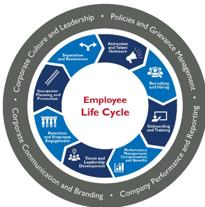
FIGURE 4. Employee Life Cycle

The second layer focuses on Organizational Enablers , which include entry points for gender equality that serve as prerequisites to support interventions within the Employee Life Cycle. These identified organizational enablers are critical, as they may either be success factors or strong hindering factors, and therefore need close attention. These enablers include Company Policies and Grievance Management, Corporate Culture and Leadership Models, Company Performance and Reporting, as well as Corporate Communication and Branding.