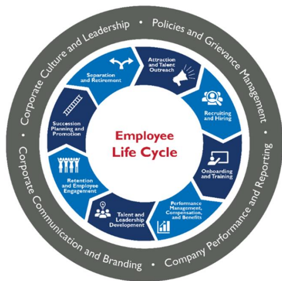
FIGURE I: Employee Life Cycle

The U.S. Agency for International Development (USAID) is committed to both promoting gender equality and women’s empowerment and strengthening all workplaces, especially in male-dominated industries where significant equality gaps are observed, in order to fuel economic growth and social development. Through its Engendering Utilities program, USAID identified the employee life cycle as a key entry point to effecting long-lasting and impactful change within partner electricity and water utilities and identified applicability to other industries. From attraction and talent outreach to separation and retirement, there are numerous opportunities to promote gender equality within any workplace.